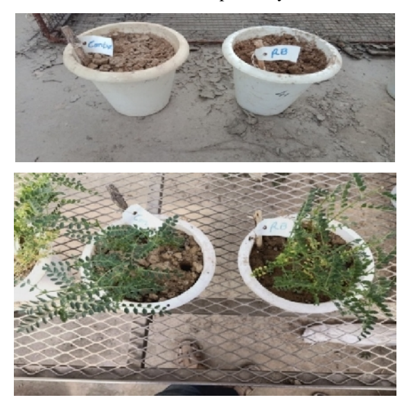
Plate 2: Pathogencity test.